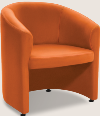
MTS-DZ007 W730 x D640 x H800