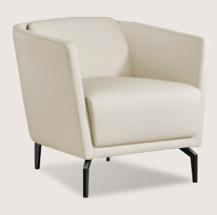
MTS-B2087 L75 x W78 x H70cm