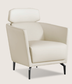
MTS-A2087 L75 x W78 x H83cm