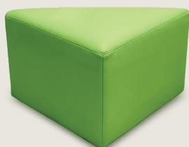
MOT-TR450J D450 x W450 x H380