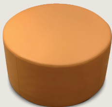
MOT-RD700S DIA 700, H450